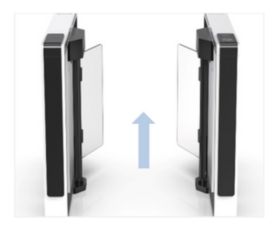
Fire Safety Requirements, Arms Open Automatically