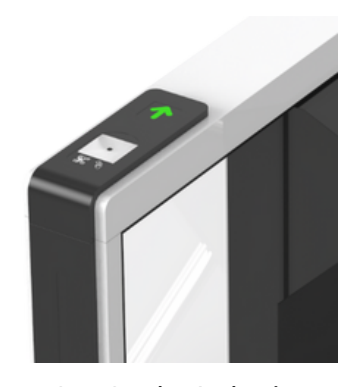
QR Code Solution