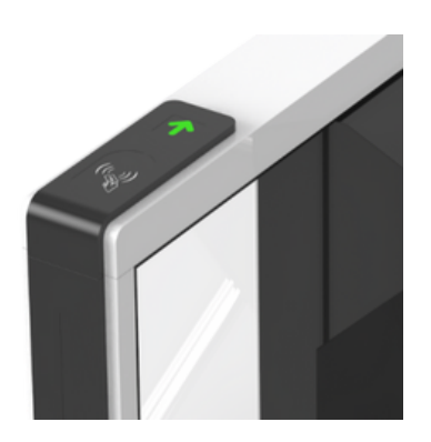
Smart Card Solution