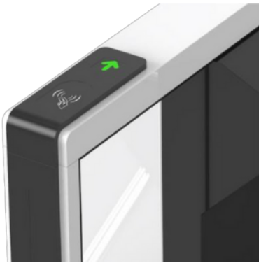
Smart Card Solution