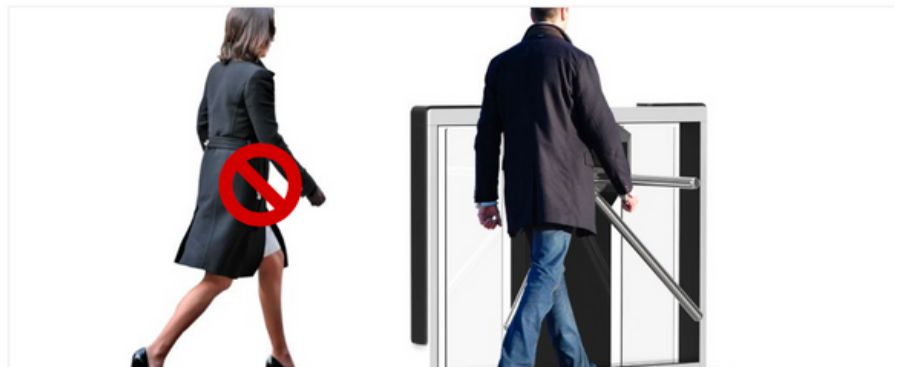
Anti-trailing Function: one person can pass at one time