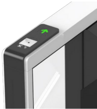
QR Code Solution